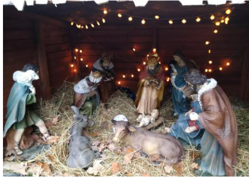
Crib Scene, Woking Crem. 2019

Prayers from Methodist Prayer Handbook, MPH, Methodist Worship, Book MWB. Other sources are as noted.