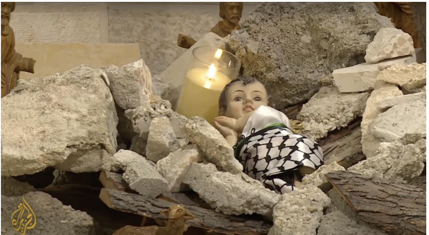
A 2023 nativity scene shows baby Jesus wrapped in a keffiyeh and placed in a pile of rubble in the Evangelical Lutheran Christmas Church in Bethlehem, the West Bank.