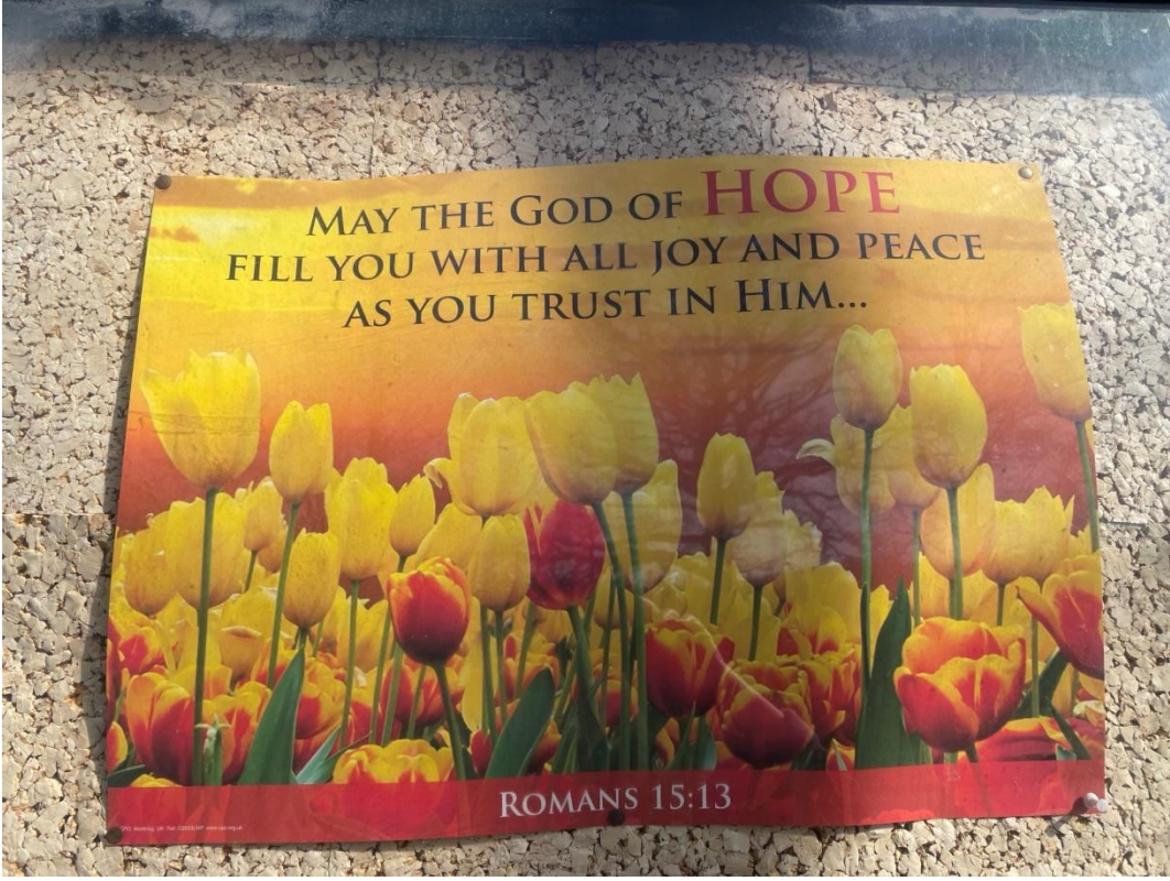
Our poster for the month