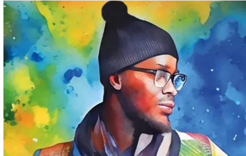
Churches Together motif for Racial Justice Sunday last year, 2025

Prayers from Methodist Prayer Handbook, MPH, Methodist Worship, Book MWB. Other sources are as noted.