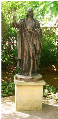
John Wesley’s statue in St Paul’s churchyard