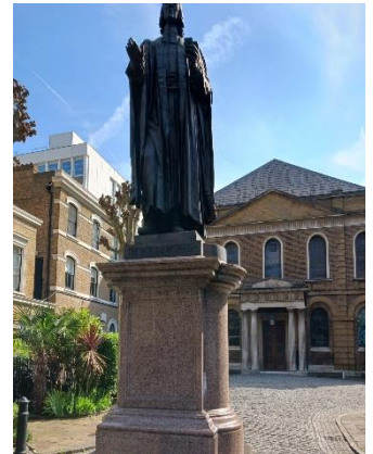
John Wesley’s statue outside Wesley’s Chapel, City Road,

(from John Wesley’s Journal , Wednesday 24 th May 1738)