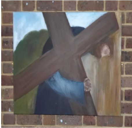
'Christ Carrying the Cross', artist unknown, Bishop Otter College Chapel Chichester