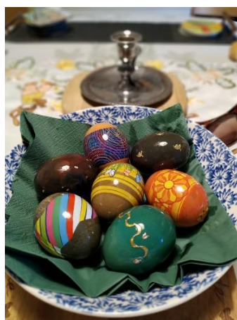
Warr Family Easter Eggs 2022