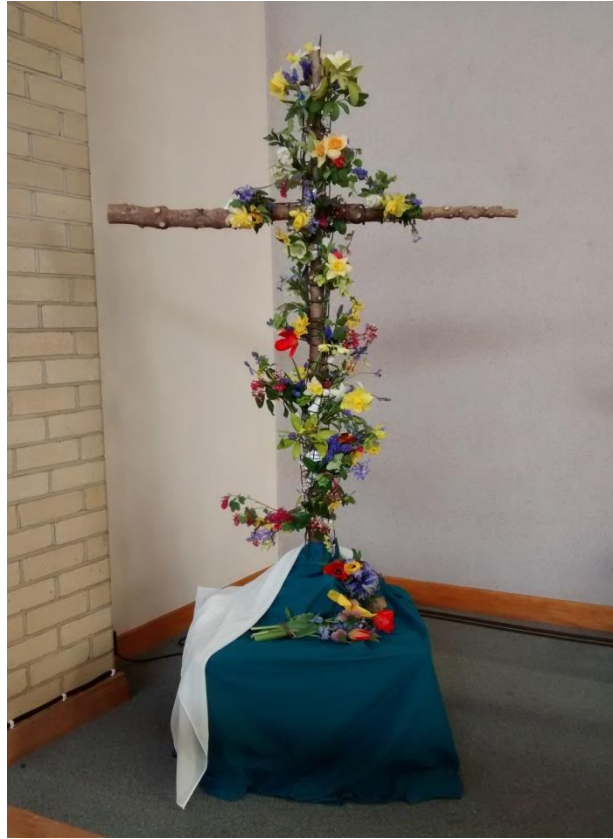
Our Easter cross and Easter flower display

'Though Mary's heart was pierced by a sword Her loss was victory – Our risen Lord.'